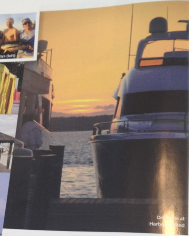
Downside at Harbour Island